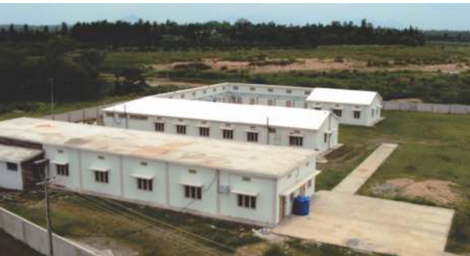
Sunrise Orphanage's new dormitory and dining room almost ready for the grand opening