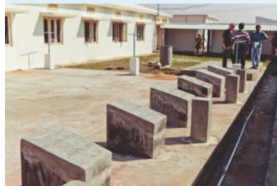
Cement blocks for washing clothes

Showers of blessing, Showers of blessing we need: Mercy drops round us are falling, But for the showers we plead.