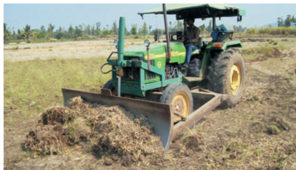
Bulldozers begin preparing the ground for construction

The total land area encompasses twelve acres. The home will take up about five acres with the remaining being used for growing crops. Rice and vegetables will grow well in the fertile farming soil enabling the home to grow some of its own food and sell some crops for income. Each child will also have his or her own vegetable plot where they will be taught gardening skills as well as the benefits and values of