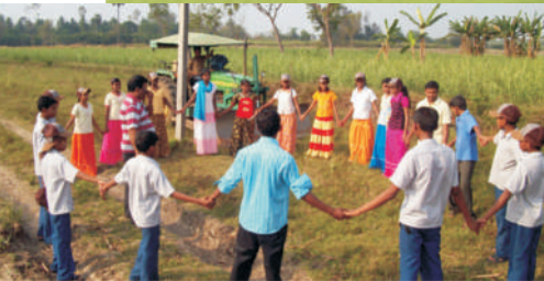
Groundbreaking dedicatory prayer with Sunrise Orphanage students

For the last two years Asian Aid has planned for the construction and raised funds for the new Sunrise Orphanage in Bobbili, India. At the beginning of March the construction team, led