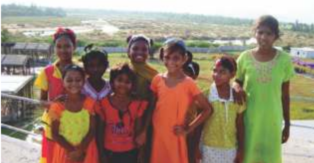
Below: Sunrise children on top of the new water tower.