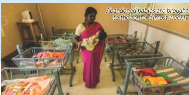
Abandoned babies are brought to the center almost weekly

The costs of operating the programs of the home are significant, and Operation Child Rescue's support of these children demonstrates Asian Aid's core belief in reaching out to children in desperate and needy situations.