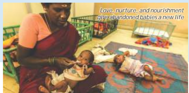
Love, nurture, and nourishment give abandoned babies a new life

Operation Child Rescue urgently needs $20,000 for staffing, cots, food, and medical supplies for this baby rescue program. WILL YOU HELP?