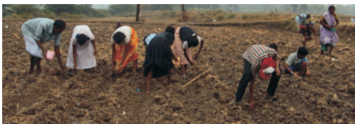
GIVING HOPE with Education and Food

This newsletter reveals the new branding for Asian Aid world wide. With offices in Australia, USA and India it was decided a new, fresh and modern logo was required. The new brand reflects the wider work Asian Aid does and the byline 'Give Hope Today' reflects the wide range of people to whom Asian Aid gives hope. It will allow us to better describe the wide range of work Asian Aid does which includes 'Giving Hope to Children', 'Giving Hope to Women', 'Giving Hope with Water' and 'Giving Hope to Villages'.