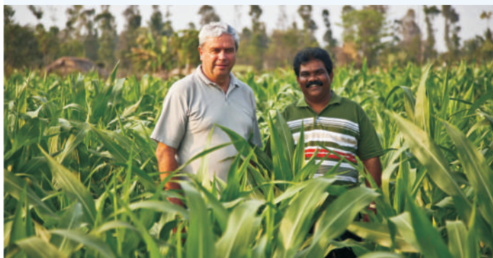
GIVING HOPE with a New Home