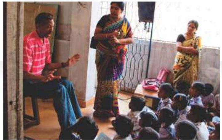
Above: A rapt audience at the Slum School