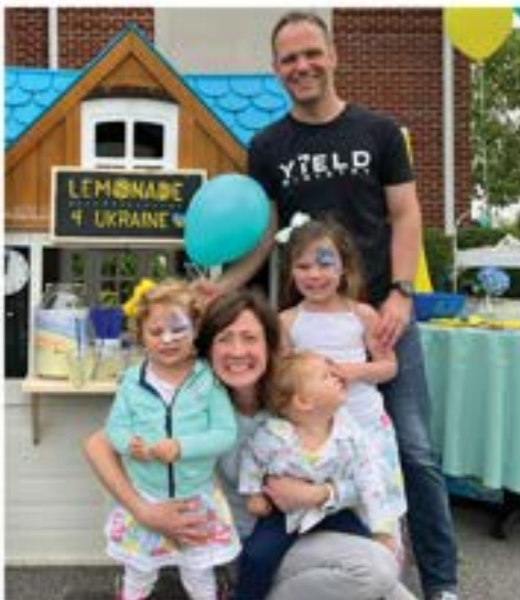
Dubs family fundraiser for Ukraine

In 2022, reaching our immediate community was a leading initiative. We are extremely grateful for the deepened engagement, especially with our local schools and churches.