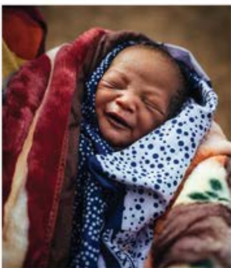
Cradle of Love baby rescue