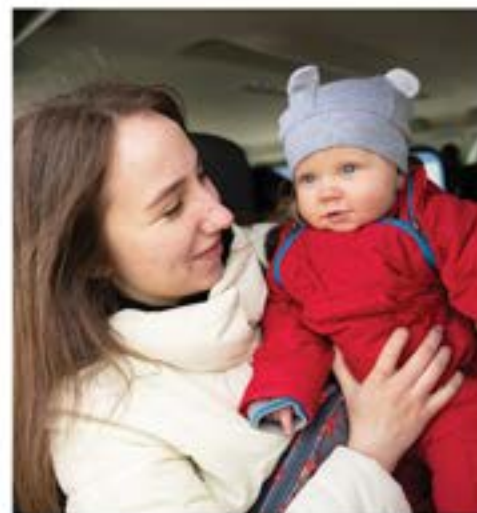
Young refugee mother and daughter