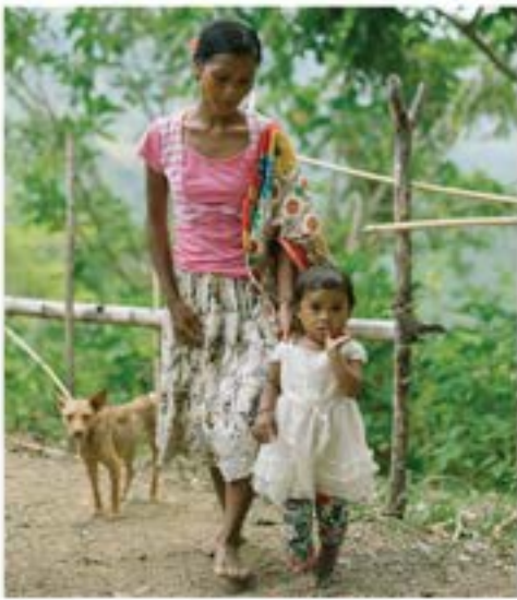
The Philippines Jungle School