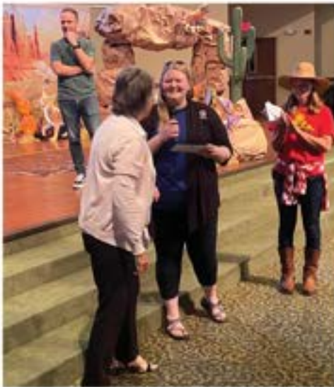
Check presentation from VBS