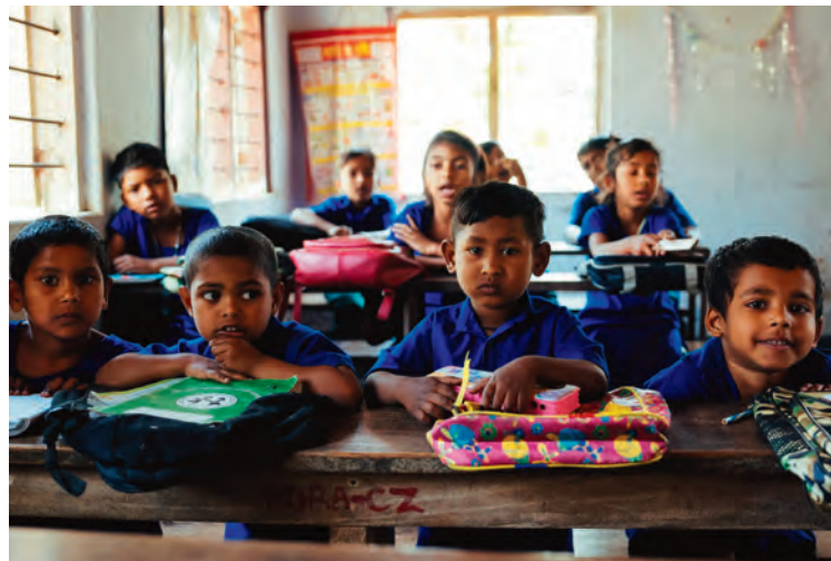
Bangladesh students in class