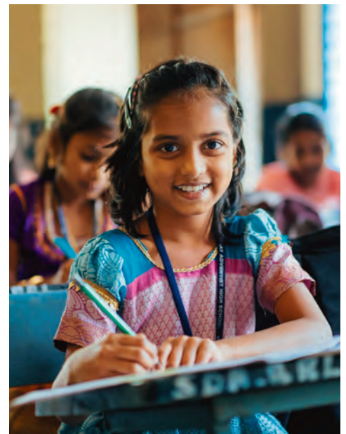
Student in Bangladesh