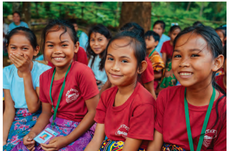
Students in the Philippines