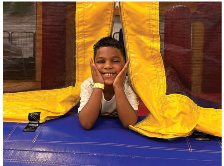
Family-friendly activities at the festival