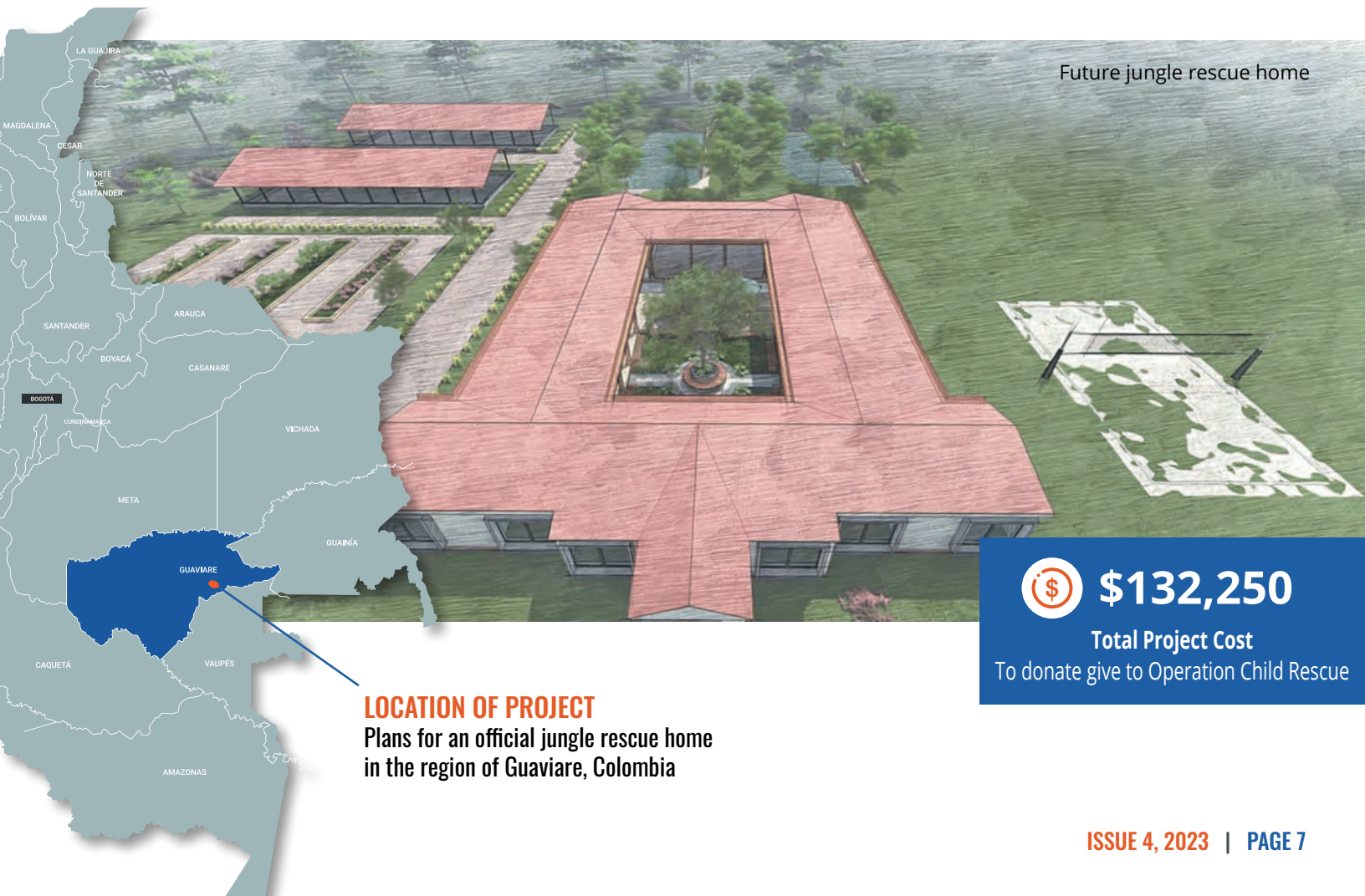
Future jungle rescue home

The entire cost of the building project is $132,250. We have set up a new foundation in Colombia, opened a bank account, and have all the licenses and permits from the Colombian Institute for Family Welfare to be able to legally provide care for indigenous girls. Please consider partnering with us on this brand new project to rescue children in the Amazon! Your gifts truly make an eternal difference!