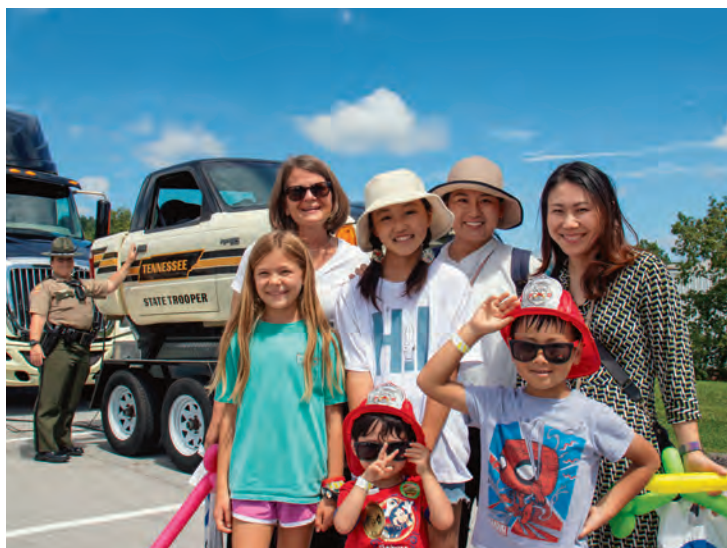
Family learning about car safety