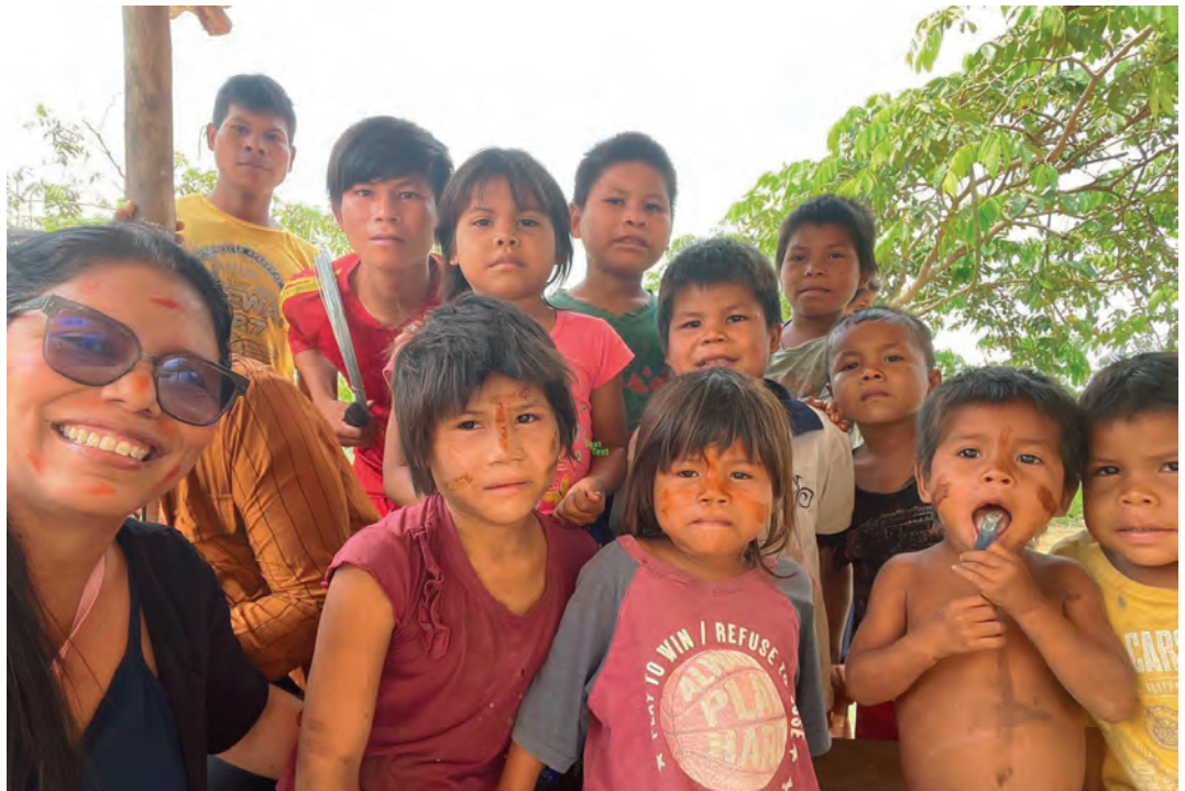
Guaviare indigenous people