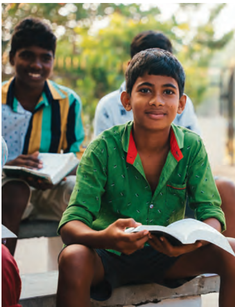
Student in India