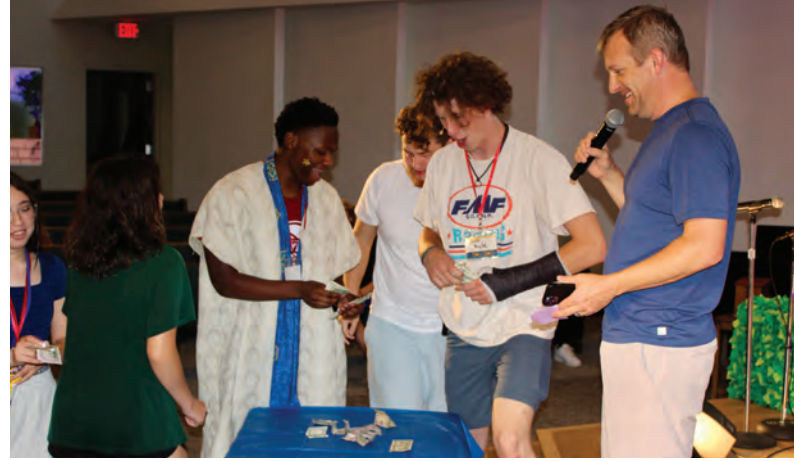
Boys' vs. girls' money war