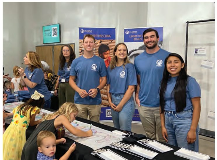
Child Impact at Crosswalk Chattanooga