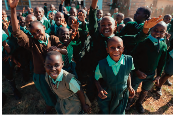
Students in Tanzania

We have 3,429 children who are supported through child sponsorship. Hundreds more are waiting for a chance to experience the life-transforming power of education. I invite you to pray, but don't delay. Visit childimpact.org/sponsor to find a student to support today.