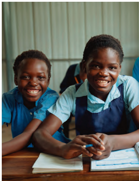
Students in Zambia