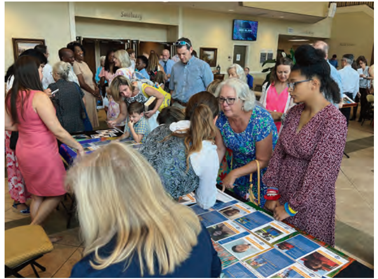
Child Impact at Collegedale Community SDA Church

In the drive to combat human trafficking, we’ve been humbled by the number of individuals who have aligned themselves with us as part of The Rescue Party. Giving monthly to Operation Child Rescue as a member of The Rescue Party allows us to sustain and expand our rescue efforts. Your decision to stand alongside us in this critical fight is a beacon of hope. Thank you for joining us on this journey against human trafficking.