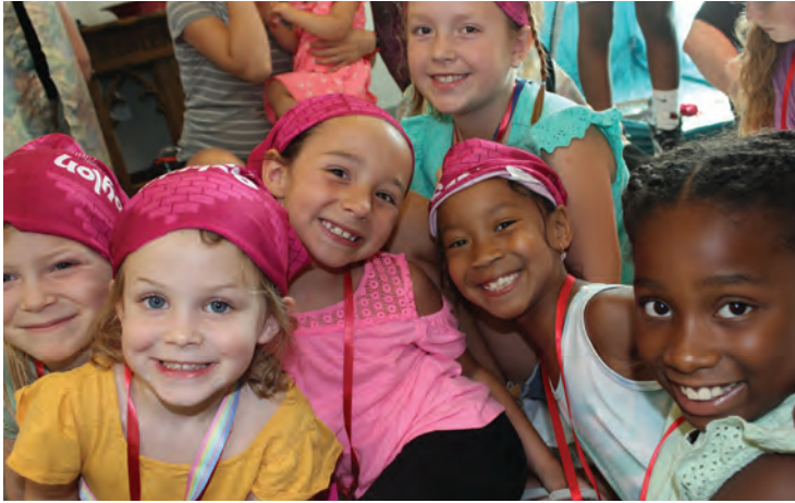
VBS girl participants