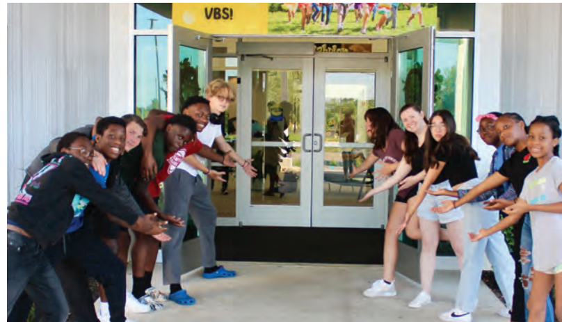
Volunteers welcoming guest

Join hands with us in bringing change through your VBS. Connect with us at development@childimpact.org to explore fundraising opportunities for Child Impact.