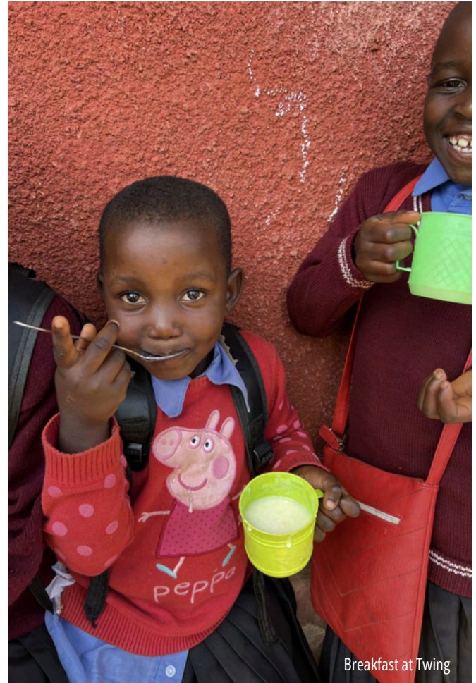
Breakfast at Twing