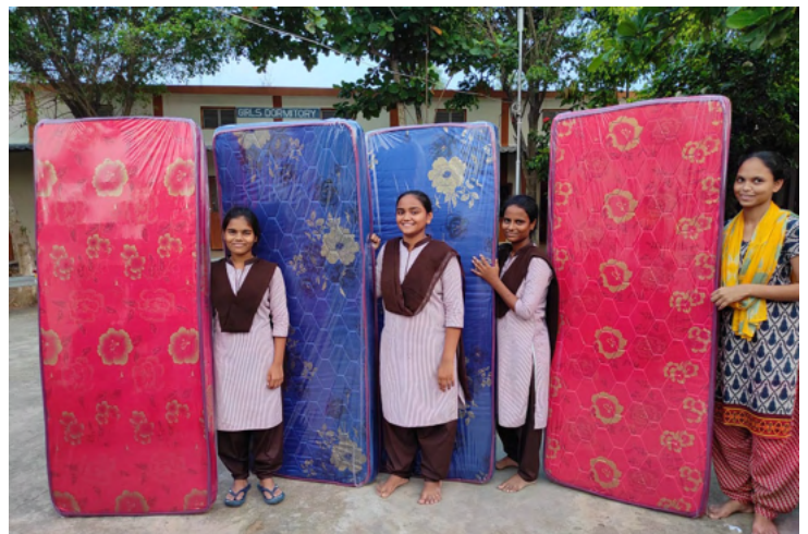
New Mattresses for Children

WITNESS AN INSPIRING STORY OF HOPE FROM SUNRISE HOME