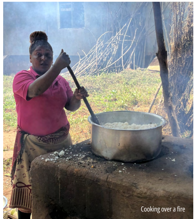
Cooking over a fire

Help us feed more children. Your donation to the Building Fund will make a significant difference at Twing Memorial schools.