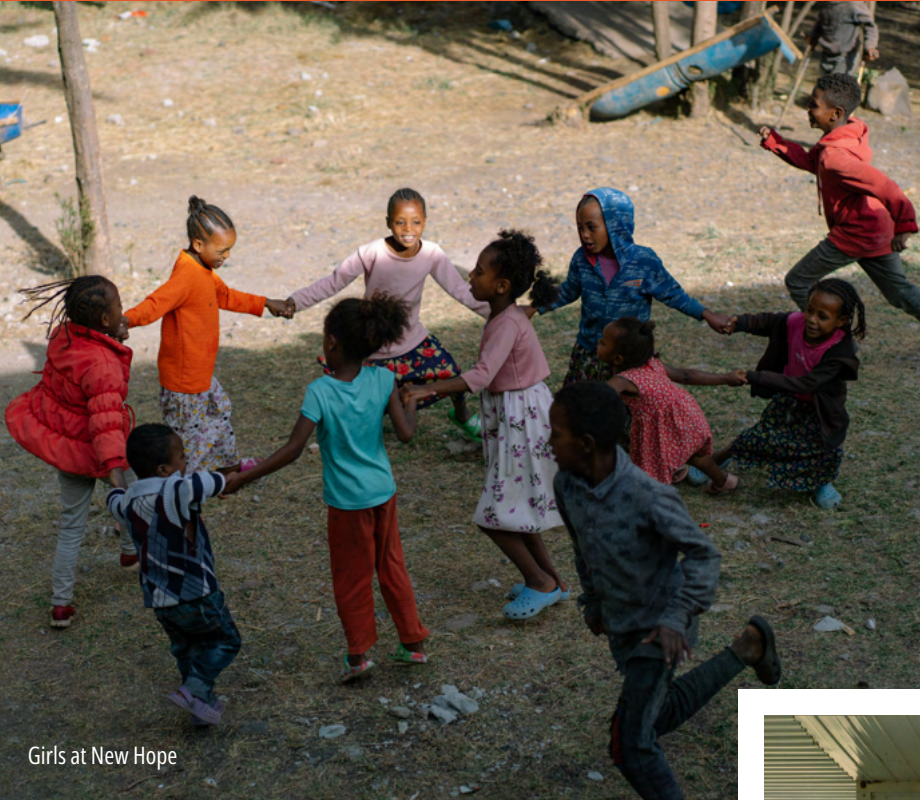
Girls at New Hope