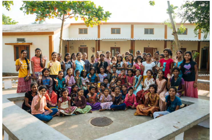
Sunrise Students and Staff