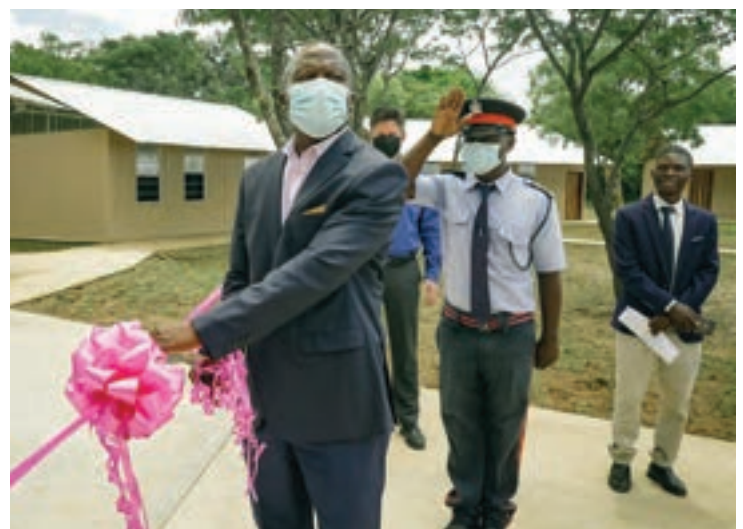
Photo: The Grand Opening Ceremony

The reminder “God is my camera” is a theme that can transform all of our lives. Character is demonstrated when no one else is looking. There is an awareness that God has called us to a higher standard. Riverside is training students to be world-changers. The influence of this new campus, led by their dedicated teachers and staff will be disseminated far and wide by the students who are blessed to attend. By the way, the question is already being asked...“What’s next?”