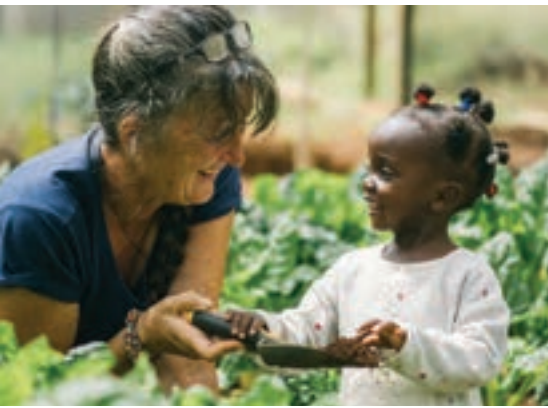
Photo: Olmalaika greenhouse

ChildImpact.org/donate/ select "Operation Child Rescue"