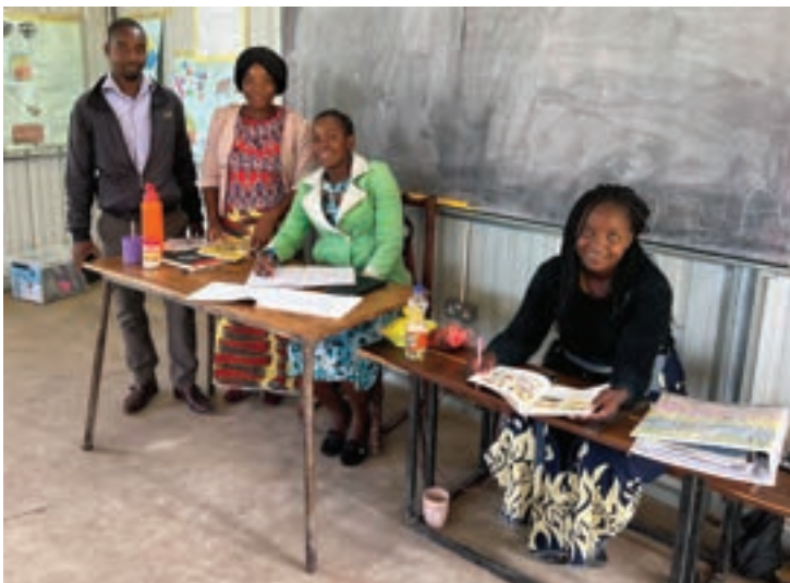
Photo: Riverside teachers preparing for opening day