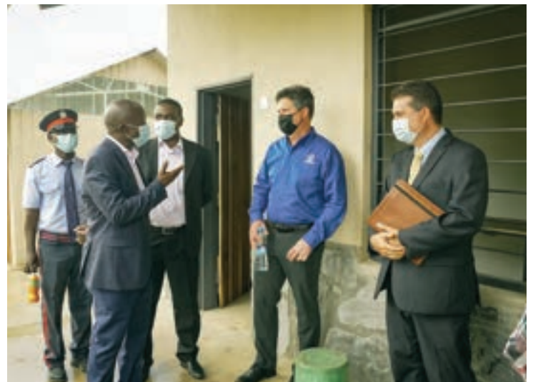
Photo: Visiting with government officials