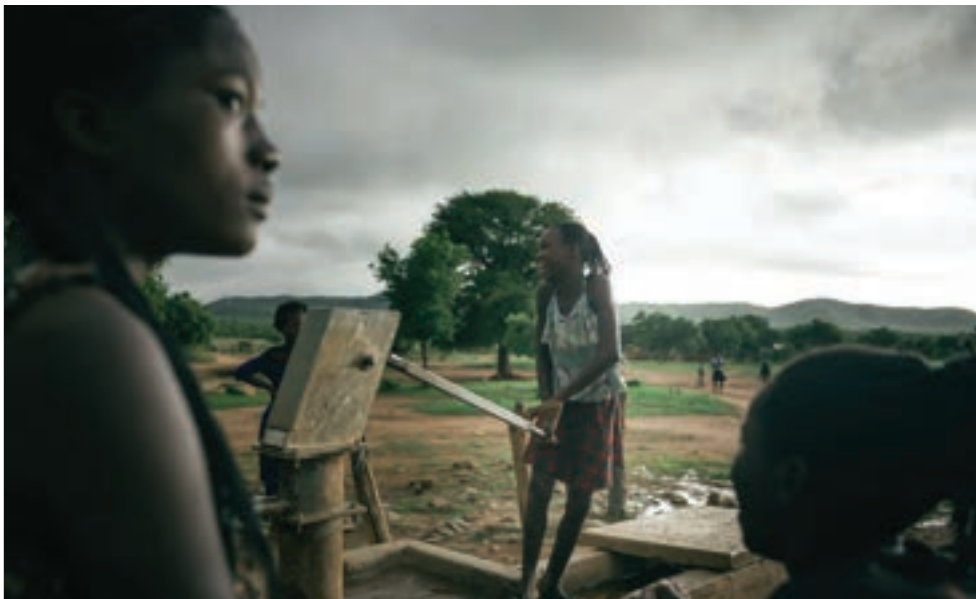
Photo: Girls at the village well near Riverside

ChildImpact.org/donate/ select "Operation Child Rescue"