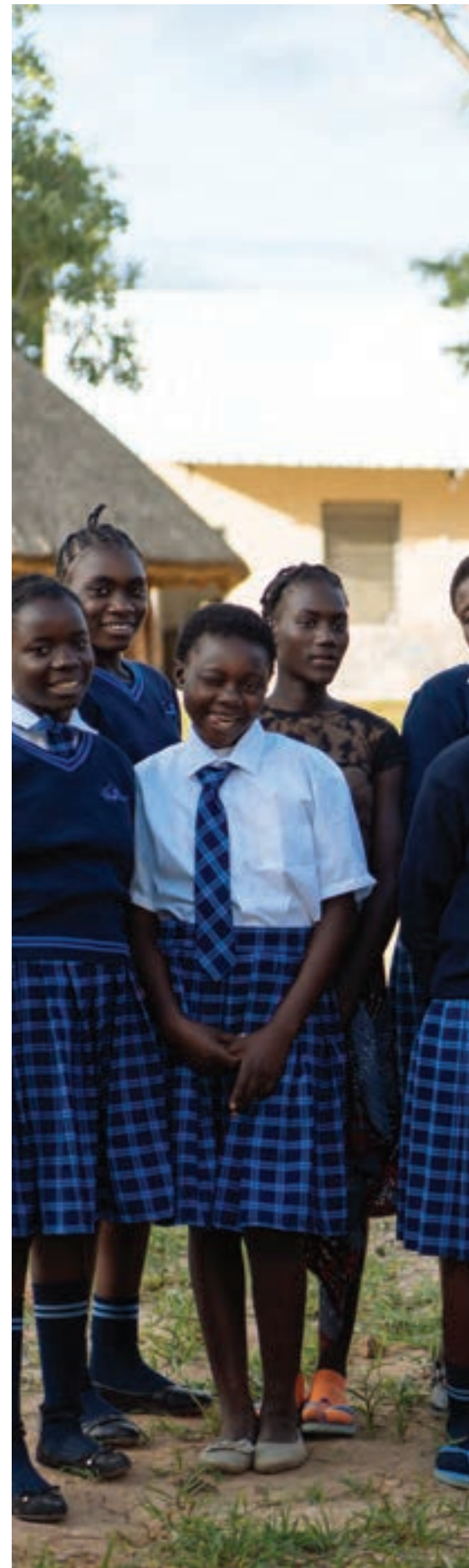
Photo: Students at Riverside Farm Institute