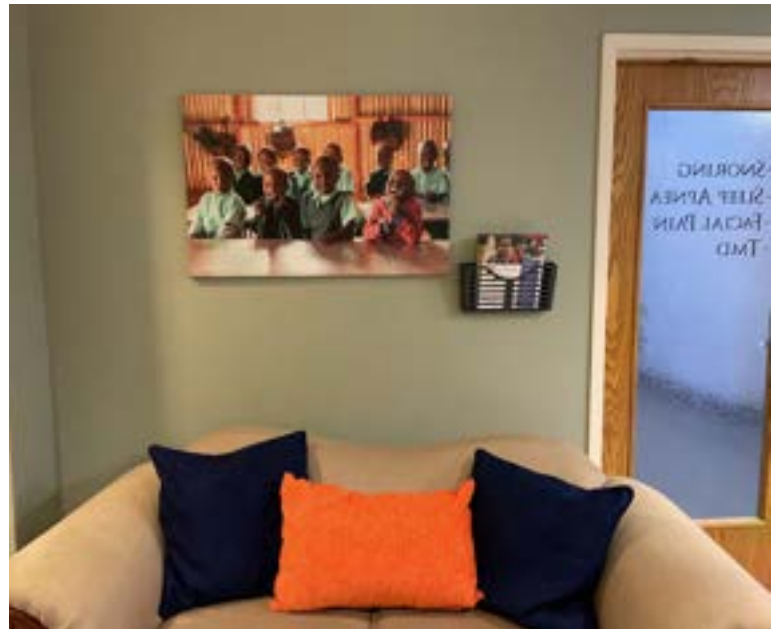
Koala Center for Sleep Disorders waiting room.