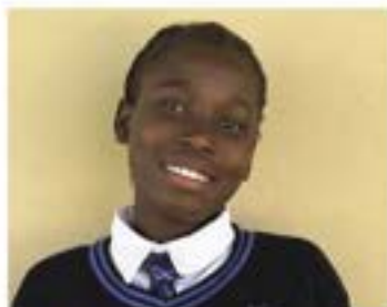
GAIKAI ID: U62365