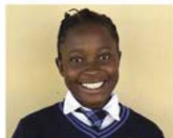
MUKWENJE ID: U62367