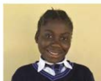
BLESSINGS ID: U62363