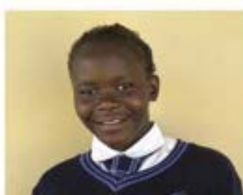
CHARITY ID: U62360