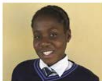
MAILES ID: U62370