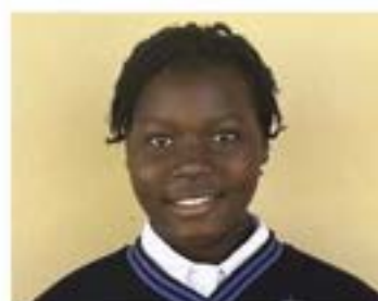
MEMORY ID: U62362