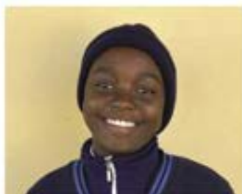
AUDREN ID: U62369

More sponsorship opportunities are available on our website: ChildImpact.org Click the "Sponsor" button.