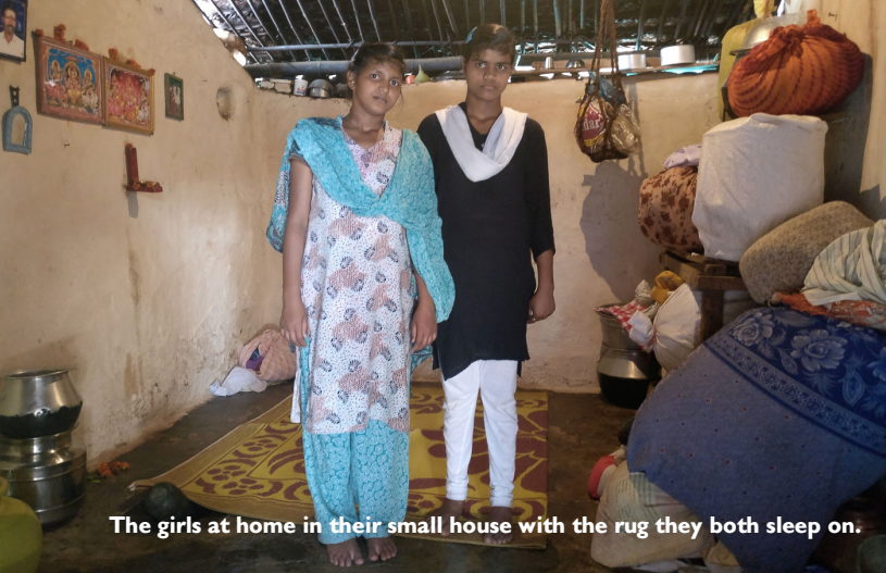
The girls at home in their small house with the rug they both sleep on.