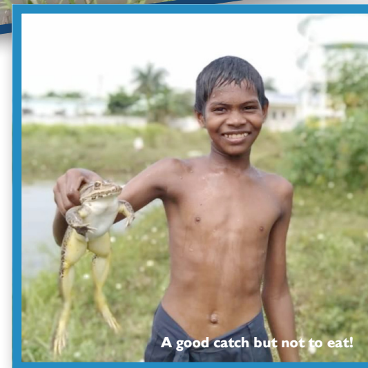
A good catch but not to eat!