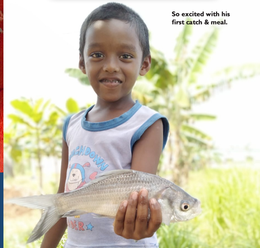
So excited with his first catch & meal.