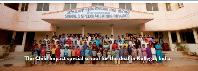
The Child Impact special school for the deaf in Kollegal, India.

These girls, in their small village had no hope, but with the help of sponsorship, their future has changed and a huge burden has been lifted from the mother. Your decision to sponsor a child like these girls will impact not only the child, but the family.