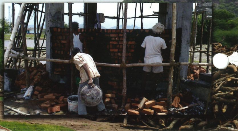
Below: Laying brick at water tower base

An Asian Aid team has been hard at work installing a new water tower on Ibrahimpatnam's campus, and the children are excited to see it rising above their campus. They are looking forward to the clean drinking water that they will soon be able to enjoy because of your generous donations towards improving schools in India.