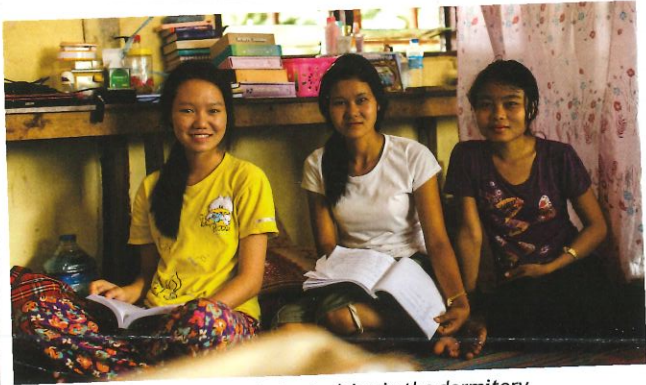
Myanmar students studying in the dormitory

You may also send donations towards this project to Asian Aid or contact us to sponsor a Myanmar student.