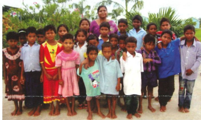
Tribal orphan children recently brought to Sunrise Home

Sunrise is located in an area where there are multiple tribal groups who live very basic and fairly primitive lives by scavenging in the forests for their sustenance. Many of them make a meager income by harvesting tamarind fruit to sell in the market. Climbing the tall trees, however, can be extremely dangerous and many fall to unfortunate deaths, leaving behind a spouse with no way to support the family or orphaned children. The life span of those in the tribal groups is only 30-40 years old, often a result of alcoholism due to a fermented drink made from different types of tree flowers. Young men and women marry early, have children, and when a spouse is lost due to a falling accident, alcoholism, or some other unfortunate fate, the children are often left to grandparents while the remaining parent finds