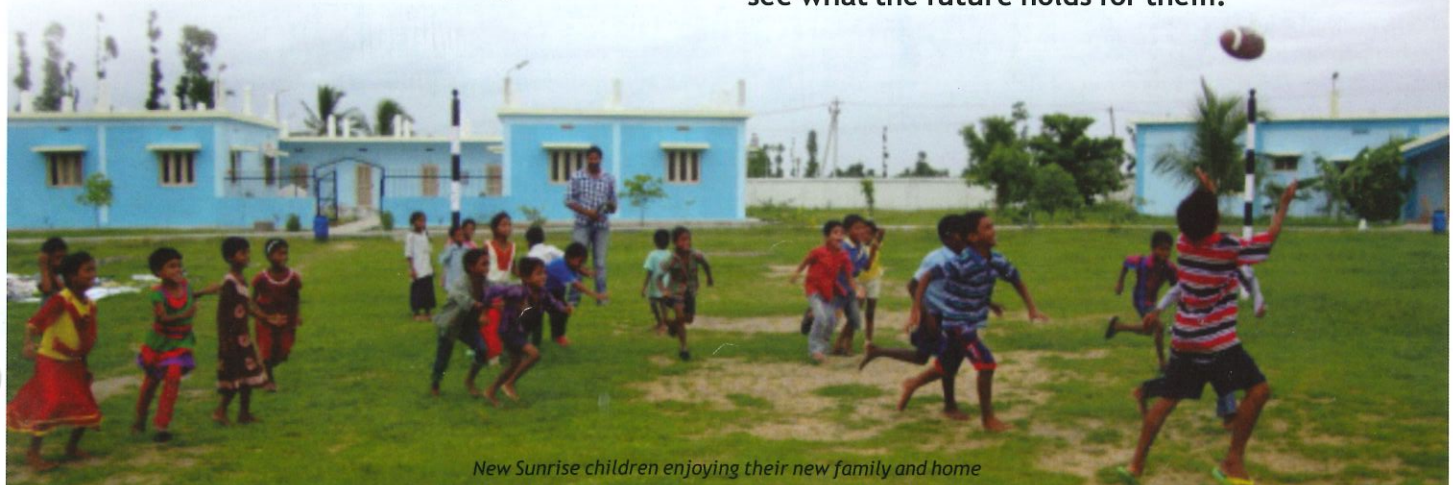
New Sunrise children enjoying their new family and home

Young children are left stranded and girls are often sold as child labor or for prostitution.