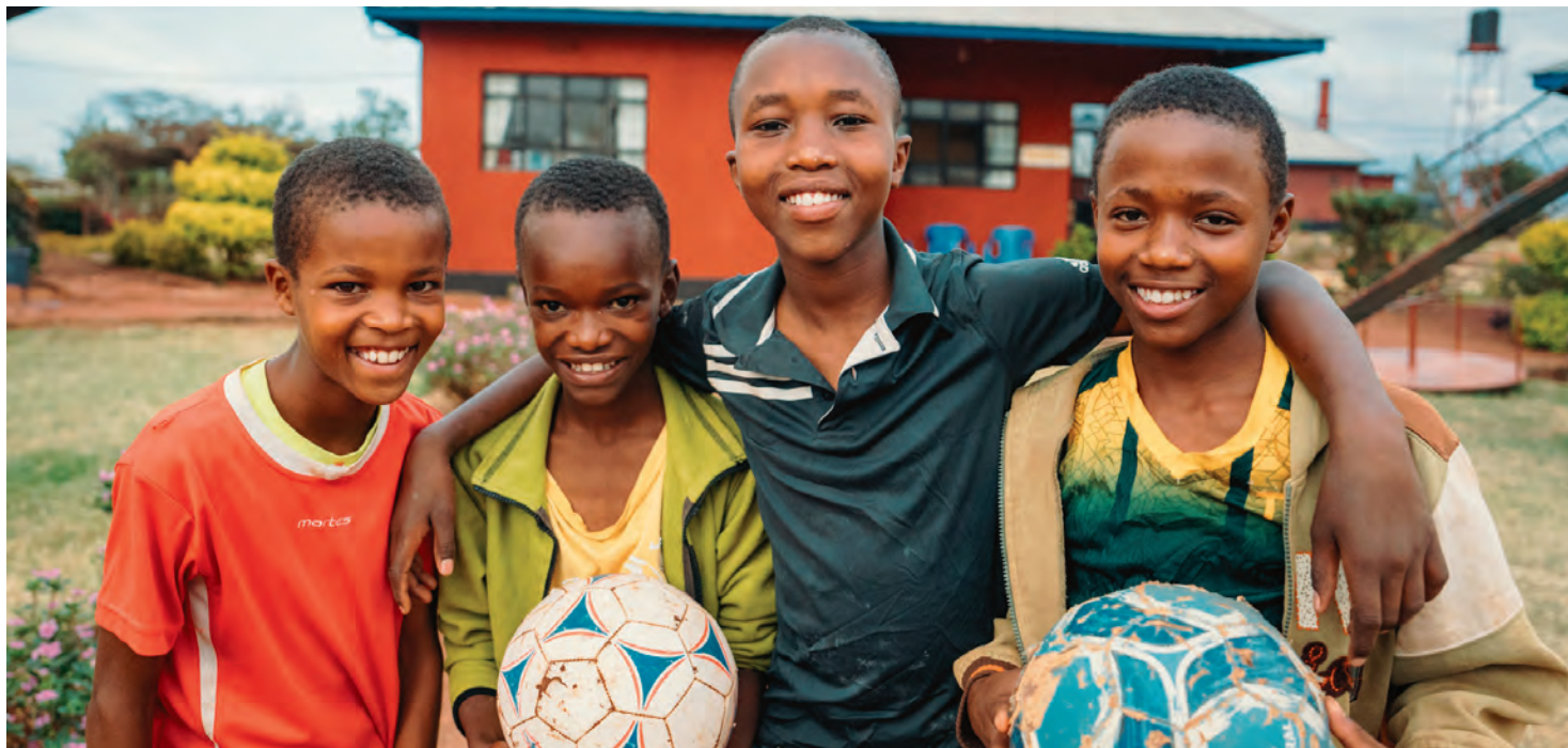
Kids will now be able to play indoors in the new building.

During our mission trip to Falco's Children's Village in October, we witnessed the completion of two new building projects to address their expansion needs. If you had visited the campus earlier, you would have noticed all the children eating together in a crowded cafeteria. Due to the increase in children served, the health department deemed the dining hall too small, prompting the need for expansion. The dining hall was significantly larger, now accommodating all the children.