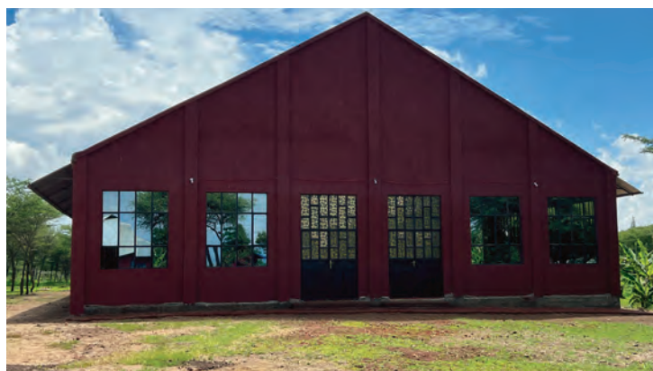
Completed multi-purpose building.