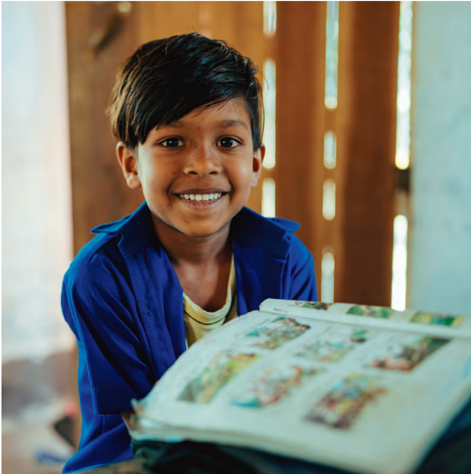
Bangladeshi elementary student.

In 2023, we were thrilled to see an average of over 100 sponsorships per month. Every sponsored child could now focus on their studies without worrying about the cost of staying in school. They could be assured that their tuition was covered, school supplies were provided, and they would receive a nutritious school lunch. Each month, 100 children were given the means to pursue their dreams. Thank you to each sponsor who made this a reality!