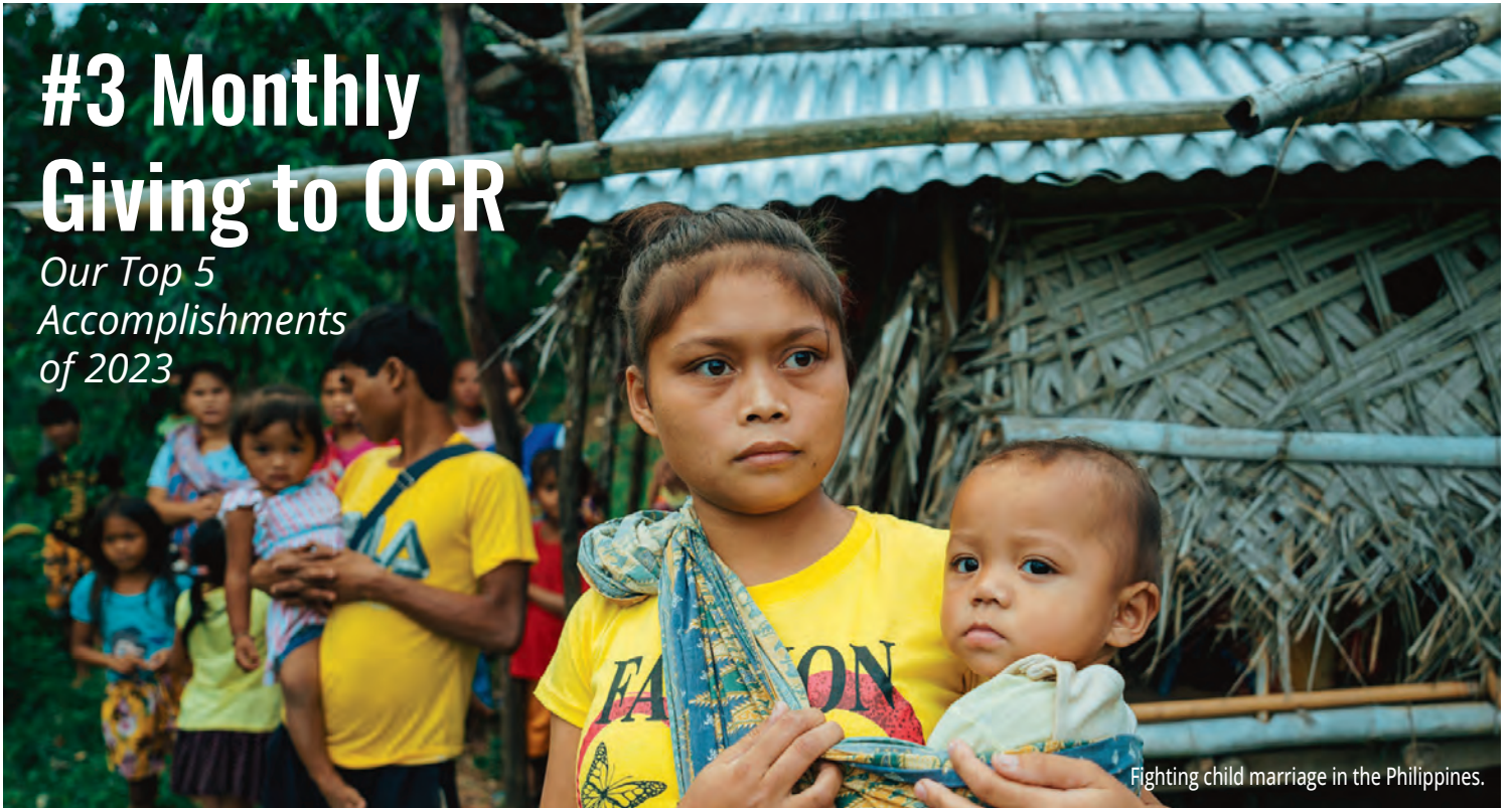
Fighting child marriage in the Philippines.

July 30 marks the United Nations World Day Against Human Trafficking. In 2023, during the weekend surrounding July 30, we hosted events in Collegedale, TN, to raise awareness about human trafficking and our projects combatting it. Additionally, we introduced The Rescue Party, our monthly giving program for Operation Child Rescue. Historically, our rescue projects heavily relied on one-time donations. The Rescue Party provides an excellent option for those who wish to support child rescue and help us combat human trafficking on a sustained monthly basis. This program is crucial because the consistent monthly support empowers us to undertake more projects. With monthly donations through The Rescue Party, we gain confidence that initiated projects can be consistently supported.