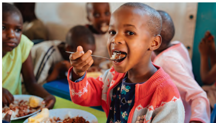
Kids can now all eat comfortably in the new dining hall.

Thank you for partnering with us to enhance the lives of children around the world!