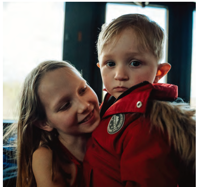
Protecting Ukrainian refugees at the Romanian border.

Continue to fight exploitation until every child is free. We want to grow "The Rescue Party" to increase the impact of OCR. To learn more, continue reading on page 8.