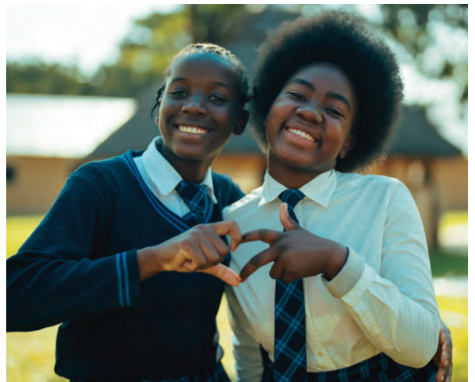
Riverside Farms highschool students, Zambia.

Share this video with 3 friends so they can see how sponsorship is making a difference in a child's life.