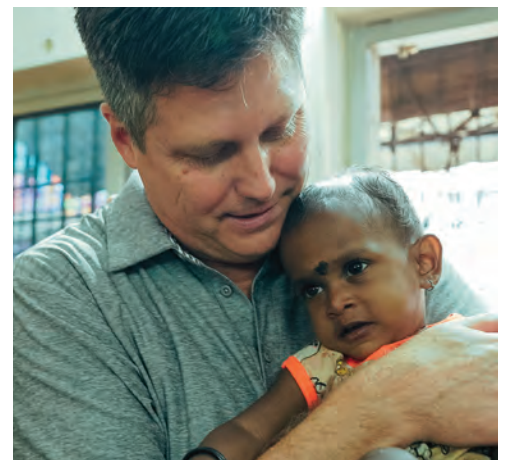
Baby girl from Vizag