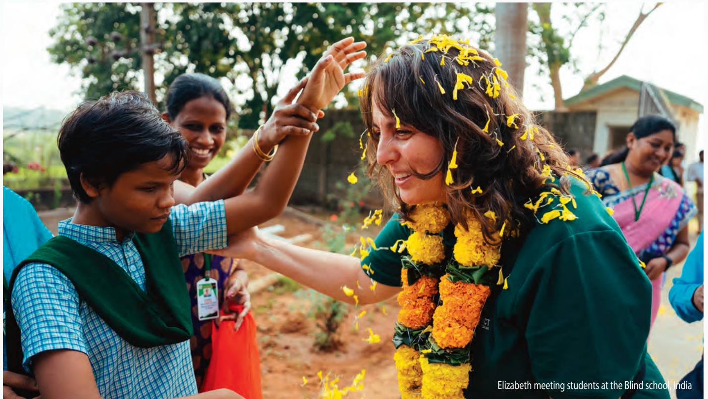
Elizabeth meeting students at the Blind school, India