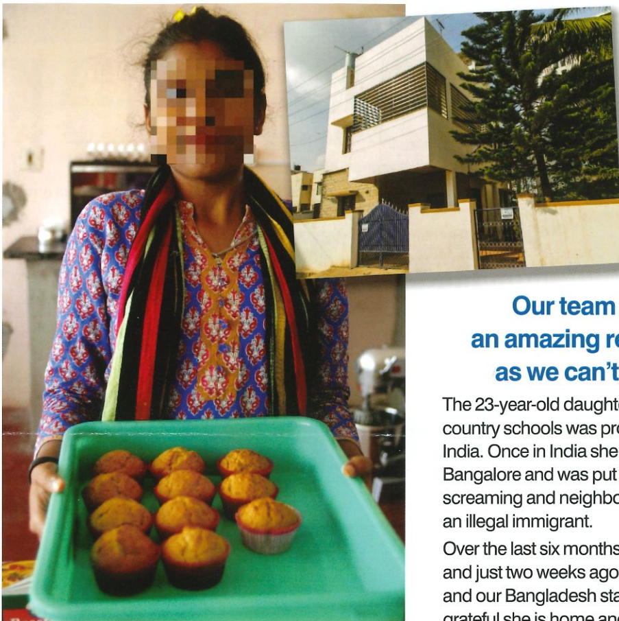
Rescued girl learning to bake