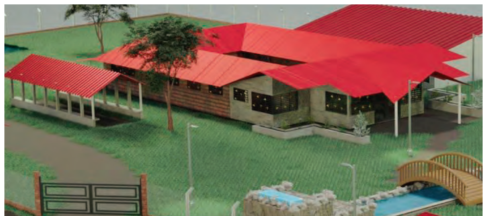
Model of the campus

Speak up for those who cannot speak for themselves, for the rights of all who are destitute. ... Defend the rights of the poor and needy. Proverbs 31:8–9 (NIV)