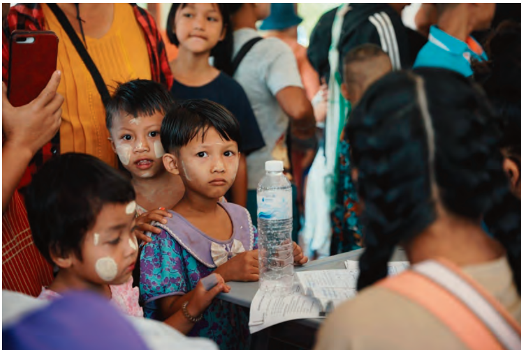
Children Enrolling to School