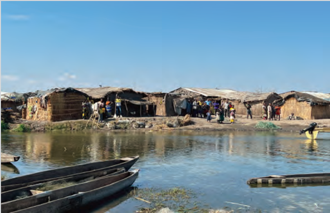
Community Along the Kafue River