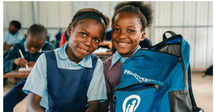
Sponsorship at the Riverside Farm’s School in Zambia