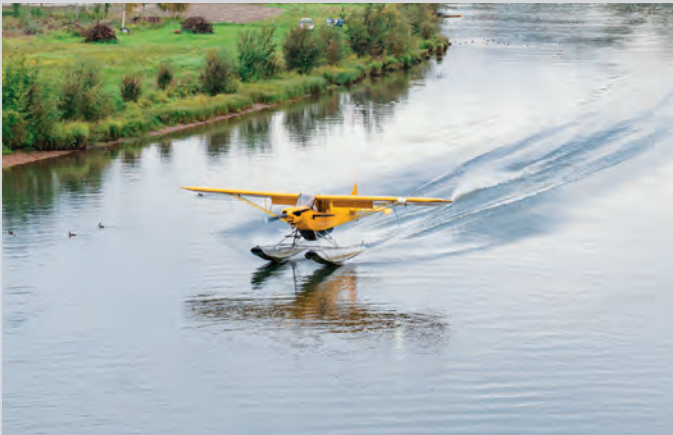
Float plane needed to reach these communities