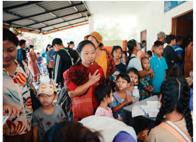
Families Waiting to Enroll Children in School

patrol to allow them to cross over. The border police allowed the children to cross but refused admission to their parents. It was humbling to see how the staff have stretched their resources to provide shelter, food, and education for these young people caught up in this terrible war. We have also agreed to build two new dormitories for elementary-age children, many of whom have come across the border alone. We are beginning construction now to be ready for the new school year beginning in June.