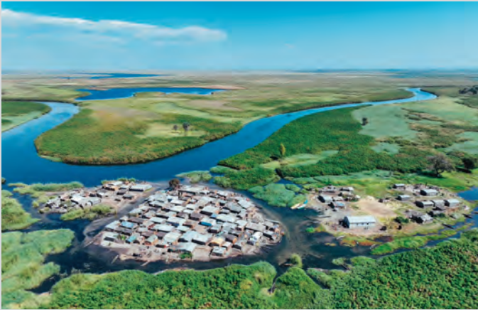
Community Along the Kafue River