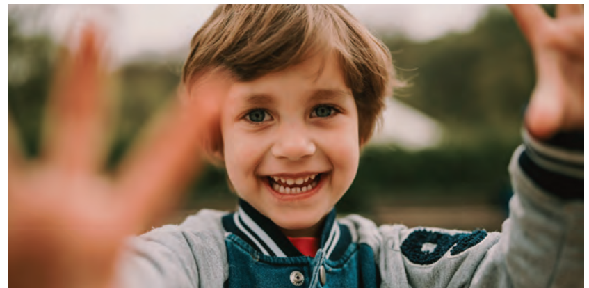
Ukrainian Refugee Project

Be diligent in these matters; give yourself wholly to them, so that everyone may see your progress. 1 Timothy 4:15 (NIV)