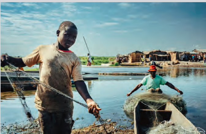
Zambian Community Along the Kafue River