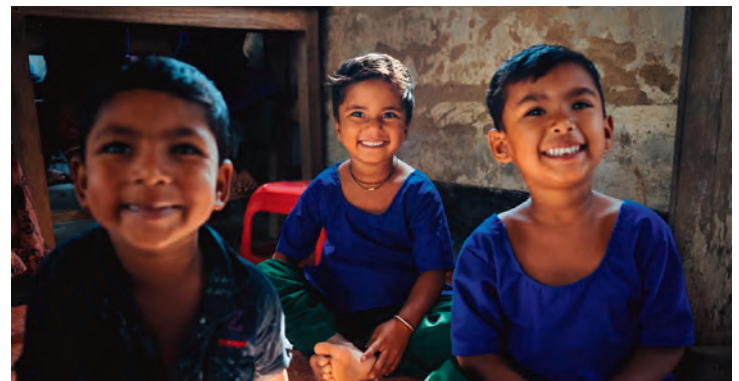
Sponsorship in Bangladesh

Be diligent in these matters; give yourself wholly to them, so that everyone may see your progress. 1 Timothy 4:15 (NIV)