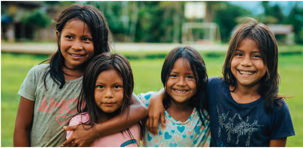
Rescue Project in Indigenous Communities in Colombia

Core Value: Through continuous growth, we increase our ability to positively impact more children.