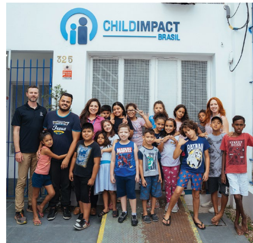
Children gather at two of Child Impact International's country offices: Child Impact Brasil (left) and Child Impact Colombia (right).