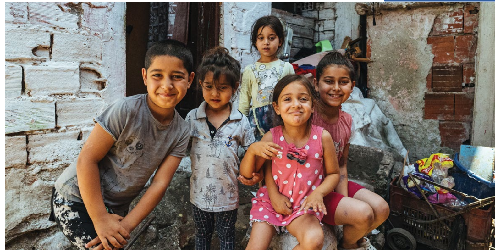
Children in Bulgaria, where Child Impact runs an Operation Child Rescue project.