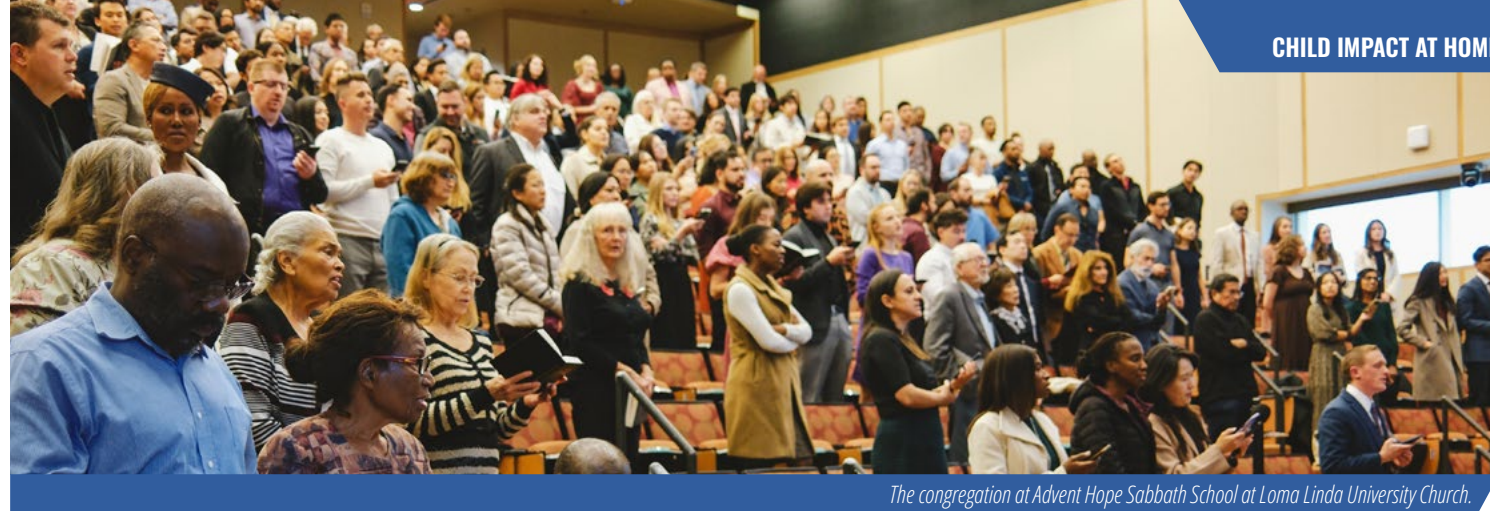
The congregation at Advent Hope Sabbath School at Loma Linda University Church.