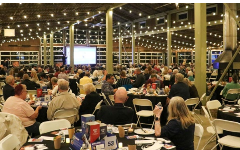
Attendees at the Heart for Children fundraiser in November in Collegedale, Tennessee.

To join us at any of these events, visit childimpact.org/dinner to learn more and to reserve your spot!